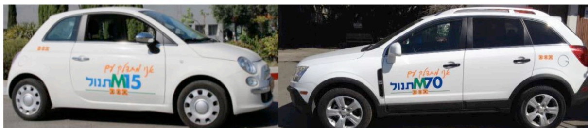
IMPCA America 2019 Haynes